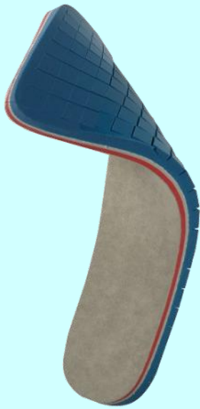
For Surgical Shoes (Shoe not included)